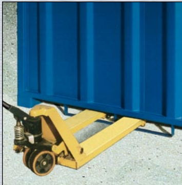
forklift pockets also suitable for pallet truck