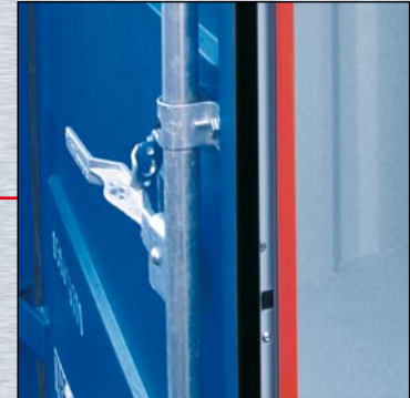
fire protection strip