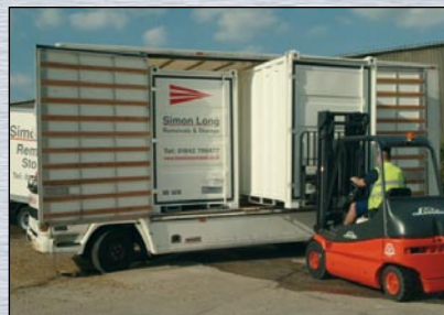
loading of the Mover-Boxes