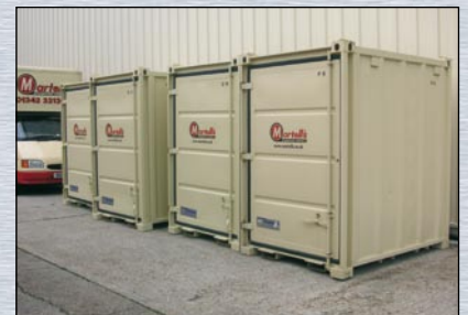
Mover-Boxes in use at a removal company