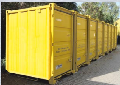
Mover-Boxes used for self storage